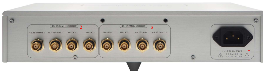
Table 2. Rear Panel