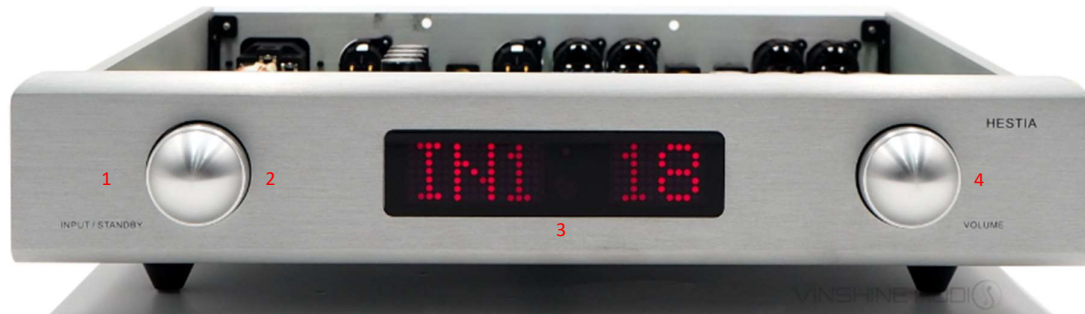
Figure 1. Front Panel