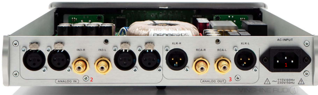
Figure 2. Rear Panel