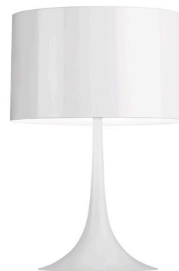
○ FU661109 Shiny White