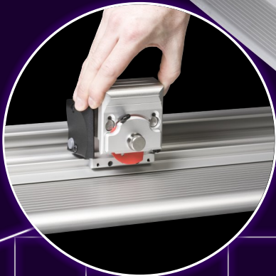
CIRCULAR BLADE CUTTER