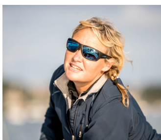
Pip Hare

The Safetics® project immediately caught the attention of 40 year old world renowned French solo sailor Armel le Cléac'h, Banque Populaire Skipper, who has been acting as Safetics® goodwill ambassador since 2013. In 2016 he broke the record for the Vendée Globe completing it in 74 days: "Whether you're an experienced skipper or just a beginner, on a powerboat or sailboat, Safetics® will improve your safety onboard" comments Armel.