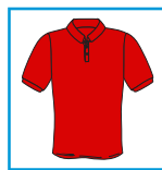
CODE: C1 LADIES/MENS RED