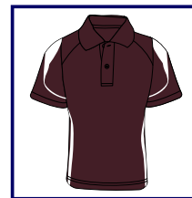
CODE: MW3 MENS ONLY MAROON/WHITE