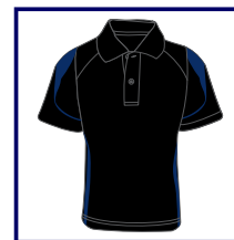
CODE: BR3 MENS ONLY BLACK/ROYAL