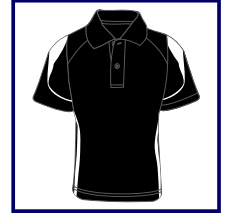
CODE: BW3 LADIES/MENS BLACK/WHITE