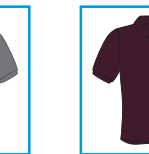
CODE: M1 MENS ONLY MAROON