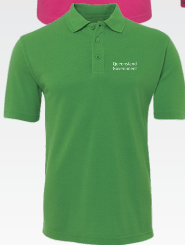
Plain Cotton Blend Polo Shirt Code: E1 Pea Green