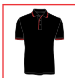
CODE: BC2 LADIES/MENS BLACK/RED