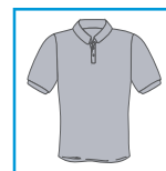
CODE: G1 MENS ONLY GREY