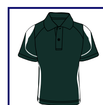
CODE: FW3 MENS ONLY BOTTLE GREEN/WHITE