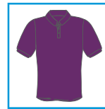
CODE: S1 LADIES MULBERRY