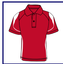
CODE: CW3 MENS RED/WHITE