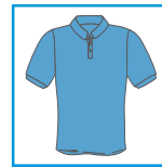
CODE: U1 LADIES/MENS AQUA