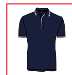
CODE: NW2 LADIES/MENS NAVY/WHITE