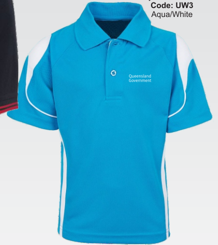
Polyester Polo Shirt Code: UW3 Aqua/White