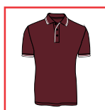
CODE: MW2 MENS MAROON/WHITE