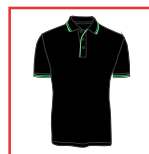
CODE: BE2 MENS BLACK/PEA GREEN