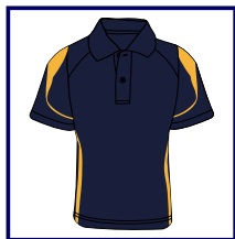
CODE: NY3 MENS ONLY NAVY/GOLD