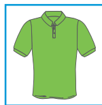
CODE: E1 LADIES/MENS PEA GREEN