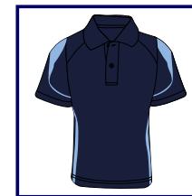
CODE: NL3 MENS ONLY NAVY/LIGHT BLUE