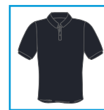
CODE: N1 LADIES/MENS NAVY