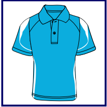
CODE: UW3 LADIES/MENS AQUA/WHITE