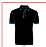
CODE: BU2 MENS BLACK/AQUA