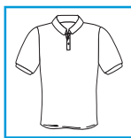
CODE: W1 LADIES/MENS WHITE