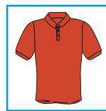
CODE: O1 MENS ORANGE