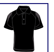
CODE: BQ3 MENS ONLY BLACK/CHARCOAL