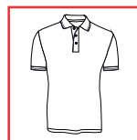
CODE: WN2 LADIES/MENS WHITE/NAVY