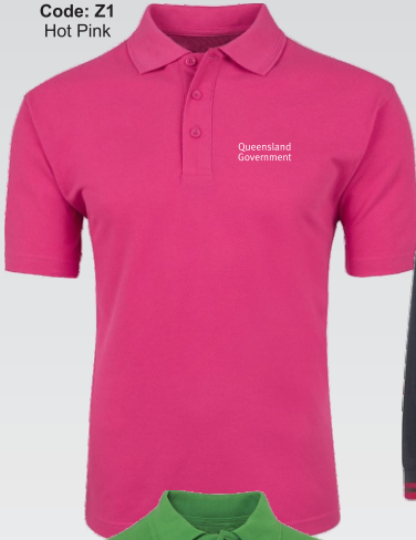
Plain Cotton Blend Polo Shirt Code: Z1 Hot Pink