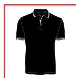
CODE: BW2 LADIES/MENS BLACK/WHITE