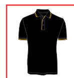
CODE: BY2 MENS ONLY BLACK/GOLD