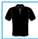
CODE: B1 LADIES/MENS BLACK