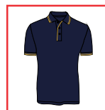
CODE: NY2 MENS NAVY/GOLD