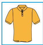
CODE: Y1 MENS GOLD