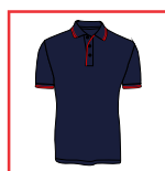
CODE: NC2 MENS NAVY/RED