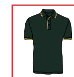
CODE: FY2 MENS ONLY BOTTLE GREEN/GOLD