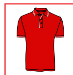
CODE: CW2 LADIES/MENS RED/WHITE