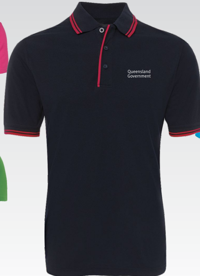
Contrast Trim Cotton Blend Polo Shirt Code: NC2 Navy/Red