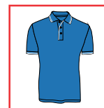
CODE: RW2 LADIES/MENS ROYAL/WHITE