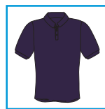
CODE: P1 LADIES/MENS PURPLE