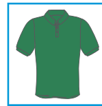
CODE: A1 LADIES/MENS KELLY GREEN