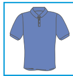
CODE: I1 LADIES IRIS