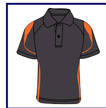
CODE: QO3 MENS ONLY CHARCOAL/ORANGE