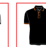
CODE: BO2 MENS ONLY BLACK/ORANGE