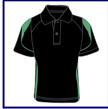
CODE: BE3 LADIES/MENS BLACK/PEA GREEN