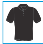
CODE: Q1 LADIES/MENS GUN METAL