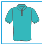
CODE: J1 LADIES/MENS JADE