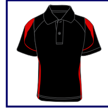
CODE: BC3 LADIES/MENS BLACK/RED