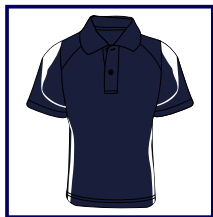
CODE: NW3 LADIES/MENS NAVY/WHITE