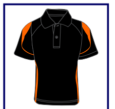
CODE: BO3 MENS ONLY BLACK/ORANGE