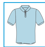
CODE: L1 LADIES/MENS LIGHT BLUE