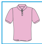
CODE: X1 LADIES ONLY MUSK