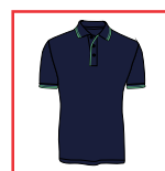
CODE: NF2 MENS ONLY NAVY/GREEN