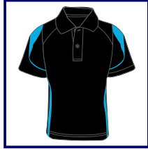
CODE: BU3 LADIES/MENS BLACK/AQUA