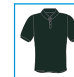
CODE: F1 MENS ONLY BOTTLE GREEN