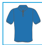
CODE: R1 LADIES/MENS ROYAL