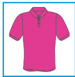
CODE: Z1 LADIES/MENS HOT PINK