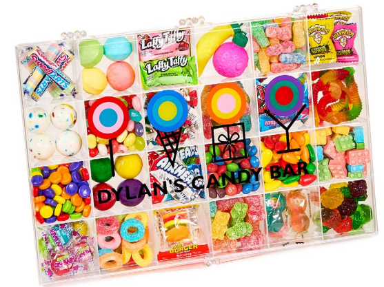
MILLENNIAL XL TACKLE BOX $85