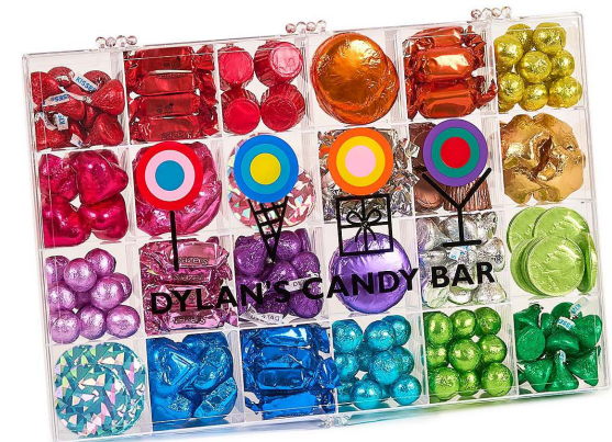
SPARKLING SWEETS XL TACKLE BOX $125