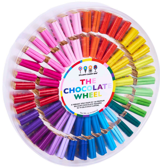
XL CHOCOLATE SQUARES COLOR WHEEL $45