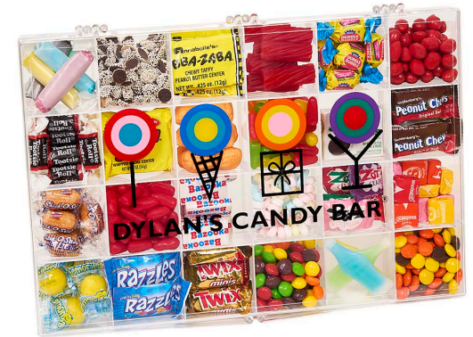
NOSTALGIA XL TACKLE BOX $85