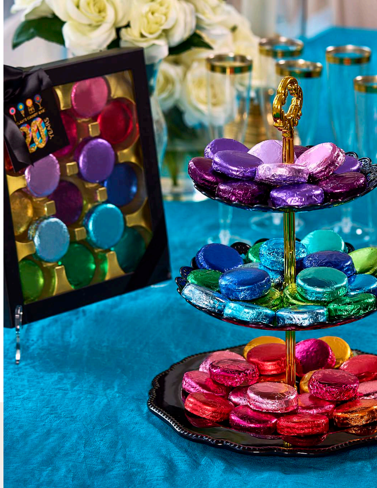
FOILED CHOCOLATE-COVERED COOKIE SET $35