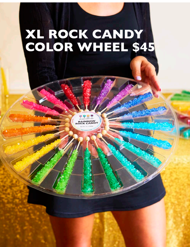
XL ROCK CANDY COLOR WHEEL $45