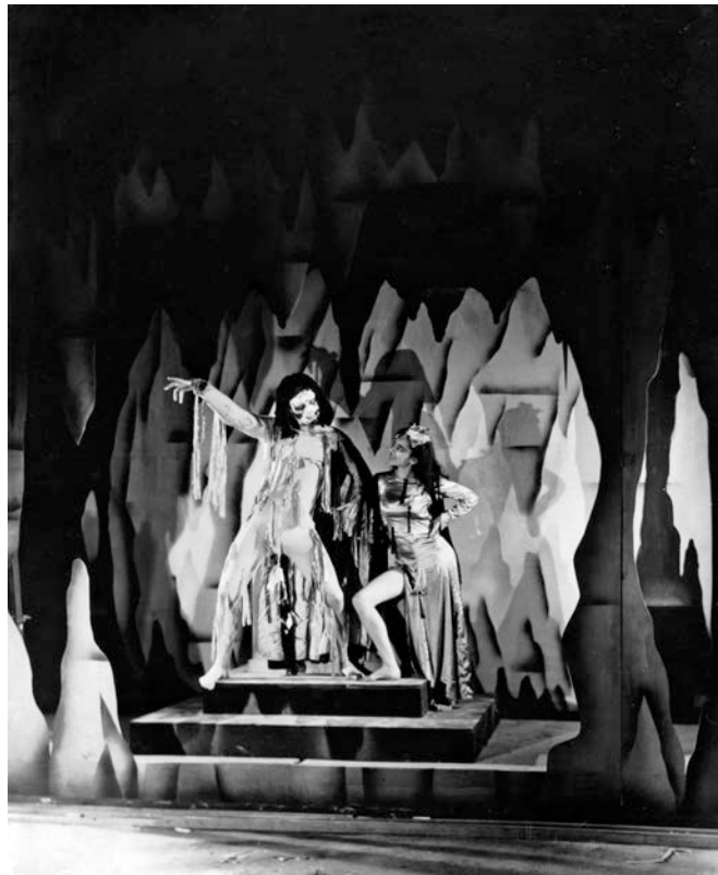
A previously unpublished photo of a young Shirley Clarke dancing as a member of the Carolina Playmakers theater group at the University of North Carolina.