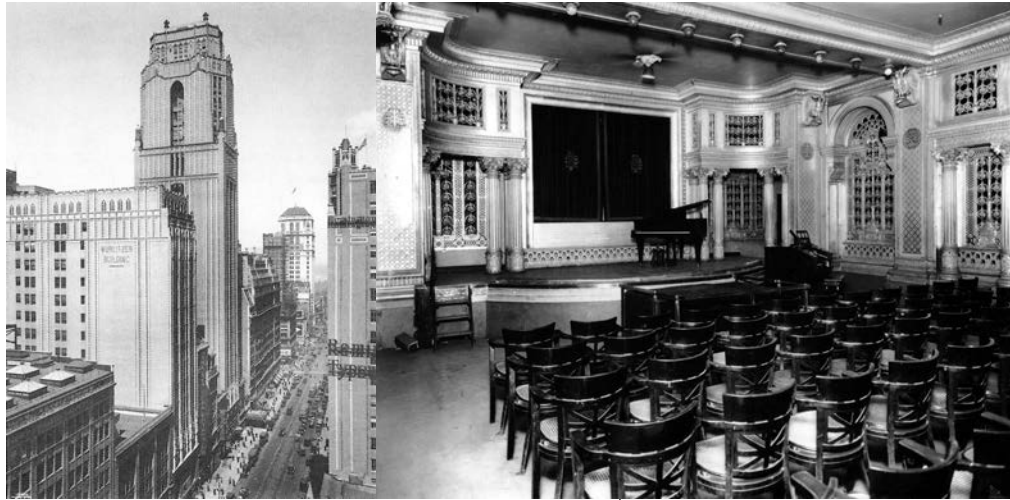
The Wurlitzer Building and Wurlitzer Hall on West 42 nd Street at the height of its fame.