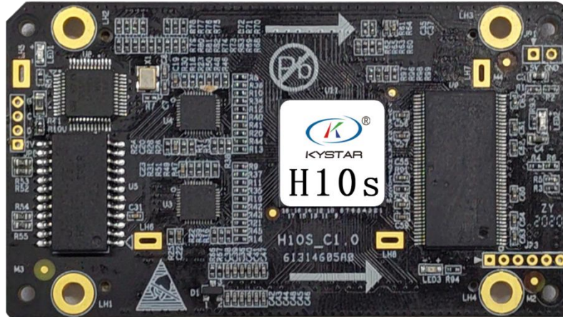
Figure 1 Front view of the H10s receiving card