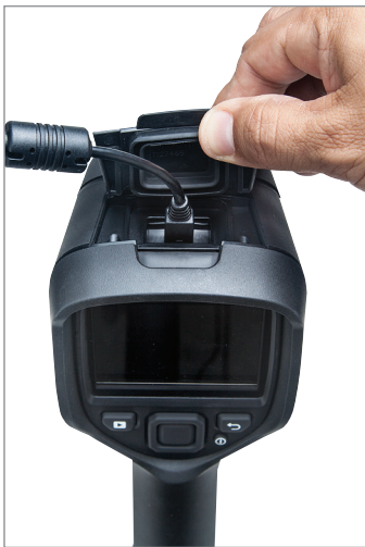
Download images fast via USB

Specifications are subject to change without notice. For the most up-to-date specifications, go to www.flir.com