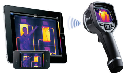
Wireless Connectivity to Smartphones, Tablets and more.