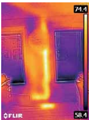
Warm Drain Pipe in Wall