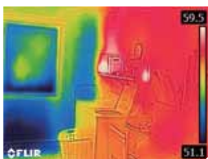
Uninsulated Outside Wall