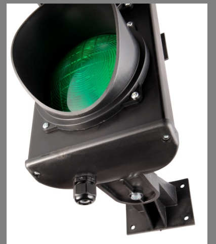
M20 cable entry