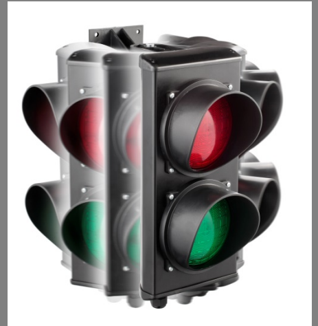
180 degree movement