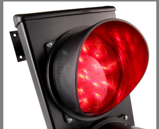
Illuminated red light