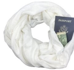
WC 6925 Haze Cream