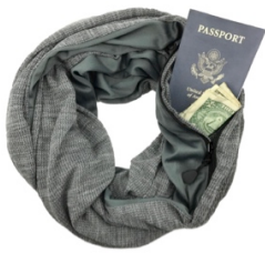
WC 6925 Haze Grey