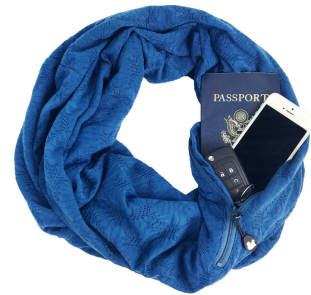
SI 97 Mystic Blue