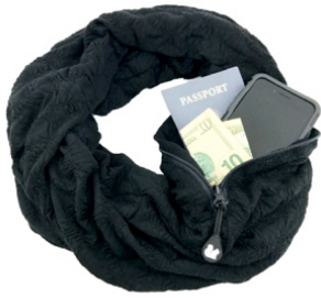
SI 97 Mystic Black