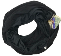
WC 6925 Haze Black