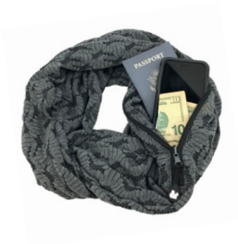
SI 97 Mystic Grey