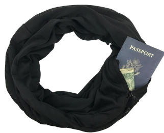
SI 1111 Bliss Black