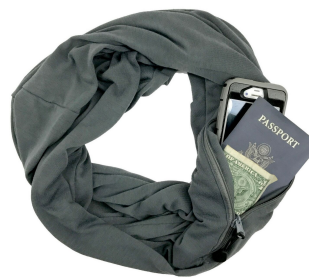
SI 1111 Bliss Grey