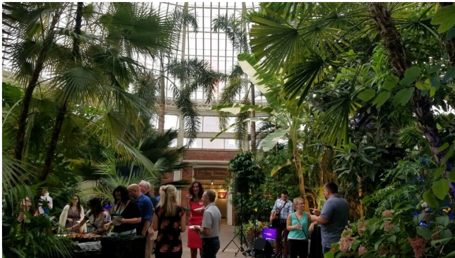
Main Palm Dome