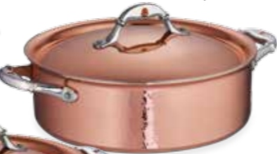
SCH 26 / 99305-I 5 qt. Braiser