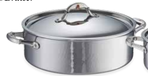
SE 30 / 99284-I 7 qt. Braiser