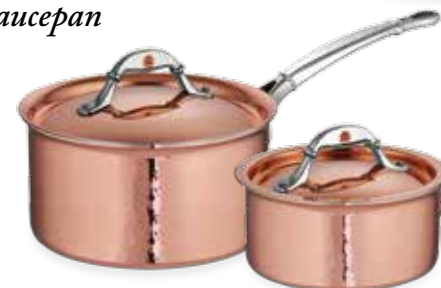
SCA 20 / 99300-I 3.5 qt. Saucepan