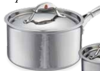
SA 20 / 99280-I 3.5 qt. Saucepan