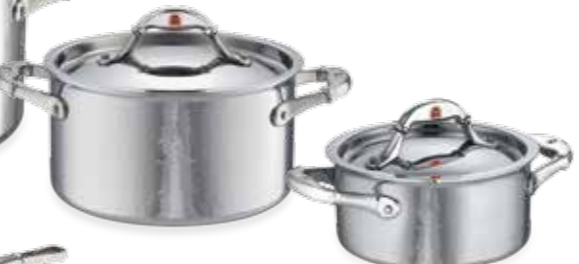
SG 20 / 99285-I 3.5 qt. Soup pot