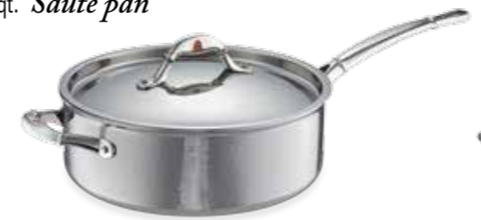
SC 26 / 99282-I 5 qt. Sauté pan