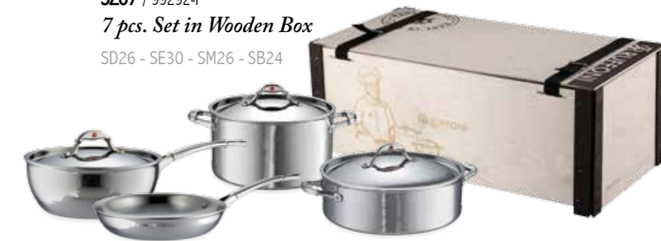
SZ07 / 99292-I 7 pcs. Set in Wooden Box SD26 - SE30 - SM26 - SB24