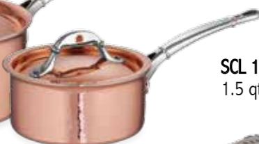
SCL 16 / 99306-I 1.5 qt. Saucepan