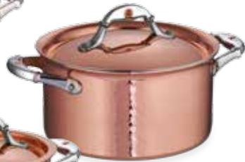
SCG 20 / 99304-I 3.5 qt. Soup pot