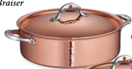
SCE 30 / 99303-I 7 qt. Braiser