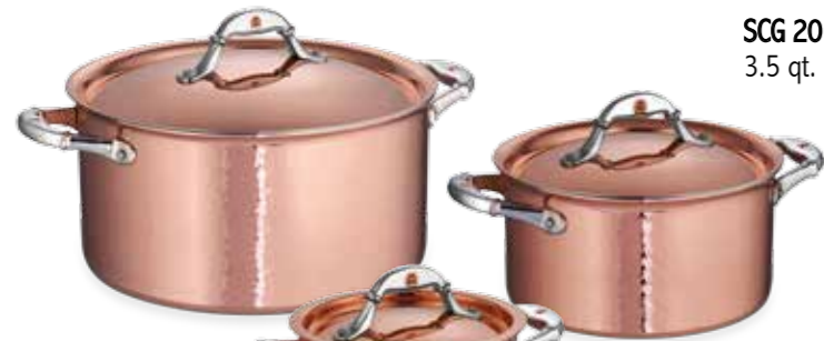
SCG 20 / 99304-I 3.5 qt. Soup pot