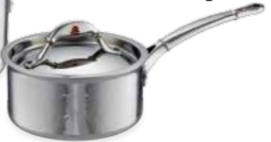
SL 16 / 99287-I 1.5 qt. Saucepan