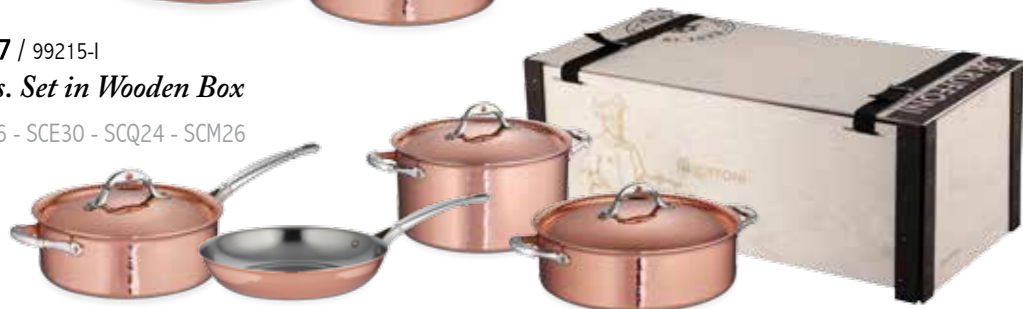
SCZ07 / 99215-I 7 pcs. Set in Wooden Box SCD26 - SCE30 - SCQ24 - SCM26