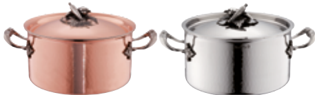
OPUS ...the ultimate hybrid cookware with hand crafted details and knob.