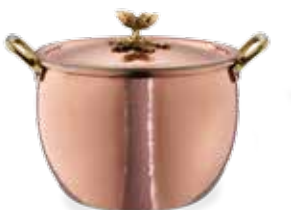
HISTORIA DECOR ...the tin lined legendary hammered copper cookware.