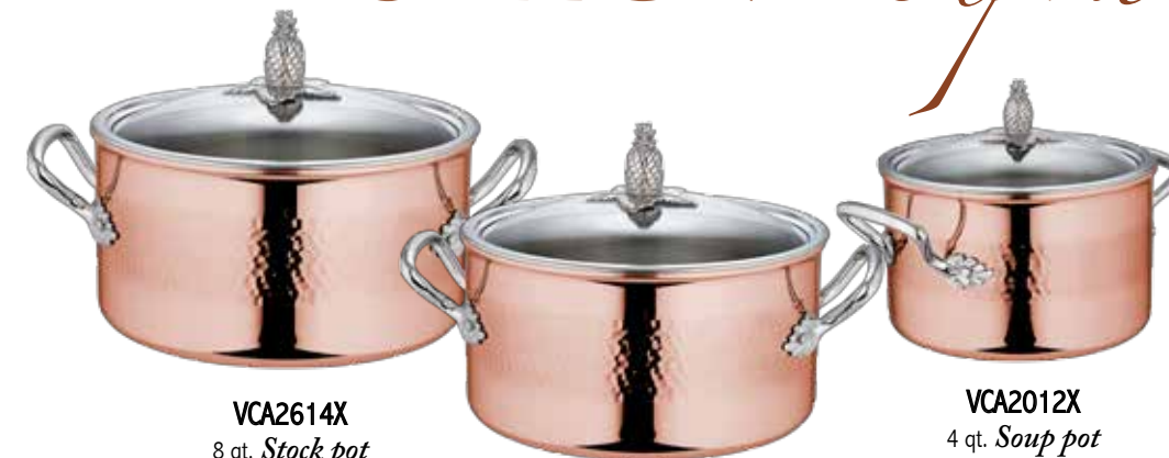
VCA2614X 8 qt. Stock pot