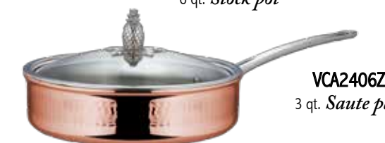
VCA2406Z 3 qt. Saute pan