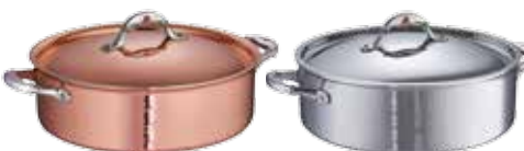
SYMPHONIA ...the highest culinary technology for unsurpassed heat conductivity.