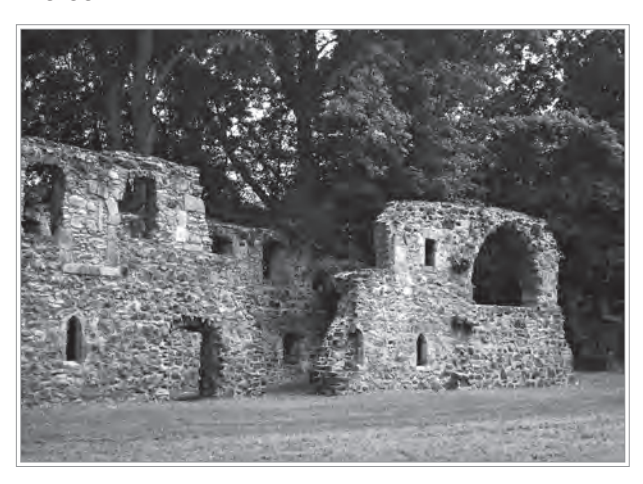
Modern ruins of Nimbschen convent

Finally, we were given something with a funny name to wear on our heads. It was called a wimple, which we removed only when we went to bed at night. When we first decided to escape, we chose to let our hair grow, always careful to keep our wimples firmly in place around the abbess. Soon, our heads began to look like newly-mown grass. We still couldn't help but giggle when we looked at each other.