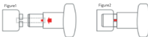
Figure 1: Correct installation direction of massage head Figure 2: Massage head installation completed