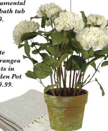
White Hydrangea Plants in Garden Pot £199.99.