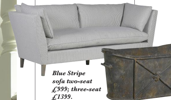
Blue Stripe sofa two-seat £999; three-seat £1399.

THE TEAM PICK THEIR FAVOURITE PRODUCTS FROM THE ES SHOWROOMS