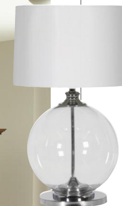
Geometric Lamb wool throw £89.95 Clifton Ball glass lamp with shade £179.