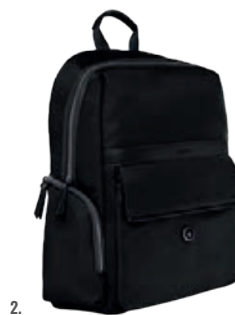
2. FTP426A Button Black Backpack

The Button bag line is made of Vegan leather (PU) and Nylon. Bags are delivered in a FESTINA Nylon bag