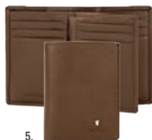
5. FLF323Z Chronobike Camel Card holder with flap