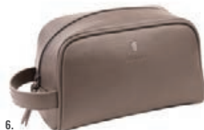
6. FTC223H Classicals Grey Dressing-case