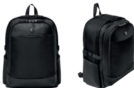
FTX426A Button Black Backpack weekend

The Button bag line is made of Vegan leather (PU) and Nylon. Bags are delivered in a FESTINA Nylon bag