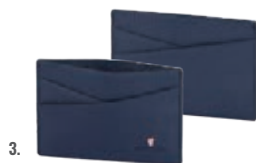
3. FLC101N Chronobike Navy Card holder