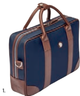
1. FTD426N Button Navy and Brown Document bag