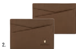
2. FLC323Z Chronobike Camel Card holder