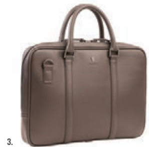
3. FTL223H Classicals Grey Laptop bag

The Classicals pen line is made of brass. Fountain pens are delivered with blue ink refills. Rollerball pens and ballpoint pens are outfitted with black ink refills as standard. Pens are delivered in a FESTINA gift box (FBS100).