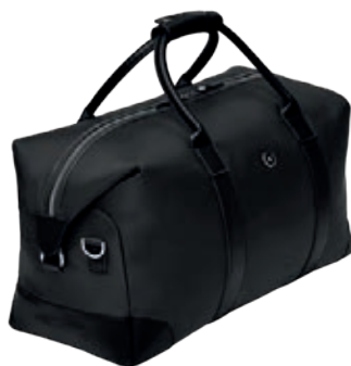
1. FTB426N Button Navy and Brown Travel bag