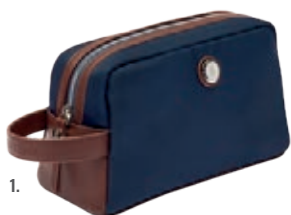
3. FTC426N Button Navy and Brown Dressing-case