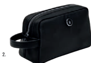
4. FTC426A Button Black Dressing-case