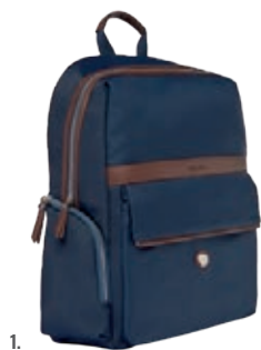
1. FTP426N Button Navy and Brown Backpack