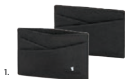
1. FLC101A Chronobike Black Card holder