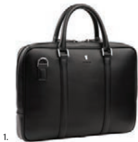
1. FTL223A Classicals Black Laptop bag