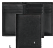
4. FLF101A Chronobike Black Card holder with flap