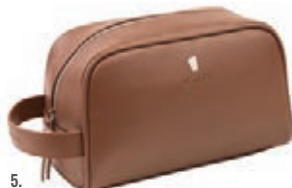
5. FTC223Z Classicals Camel Dressing-case