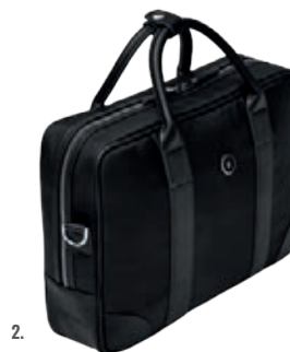
2. FTD426A Button Black Document bag

The Button bag line is made of Vegan leather (PU) and Nylon. Bags are delivered in a FESTINA Nylon bag