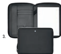
3. FTM423A Chronobike Black A5 Conference folder A5

The Chronobike folder line is made of vegan leather. The paper refill contains 40 pages. Folders are delivered in a FESTINA gift box.