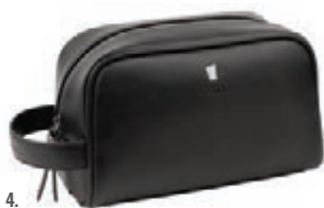
4. FTC223A Classicals Black Dressing-case