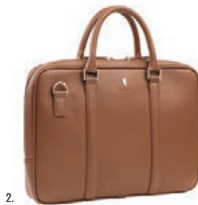
2. FTL223Z Classicals Camel Laptop bag