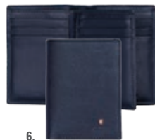
6. FLF101N Chronobike Navy Card holder with flap

The Chronobike mall leather goods line is made of genuine leather. Wallets and cardholders are delivered in a FESTINA gift box.