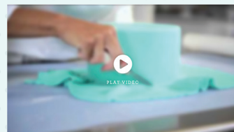
Covering and Trimming