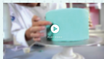
Troubleshooting the Basics

For tutorials, inspiration galleries and more, visit