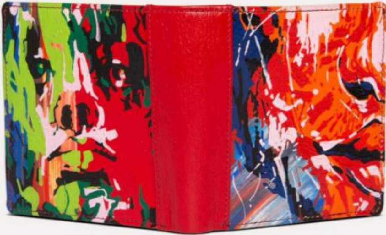
Paul Adams Amie wallet

Handcrafted homegrown luxury endeavour Paul Adams has launched a Christmas special range of stylish leather handbags, clutches and wallets which might just be the go-to accessories for you this season.