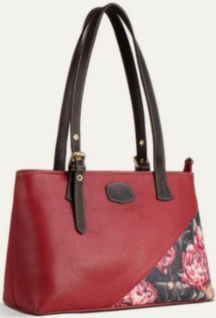
Paul Adams Bella handbag

Handcrafted homegrown luxury endeavour Paul Adams has launched a Christmas special range of stylish leather handbags, clutches and wallets which might just be the go-to accessories for you this season.