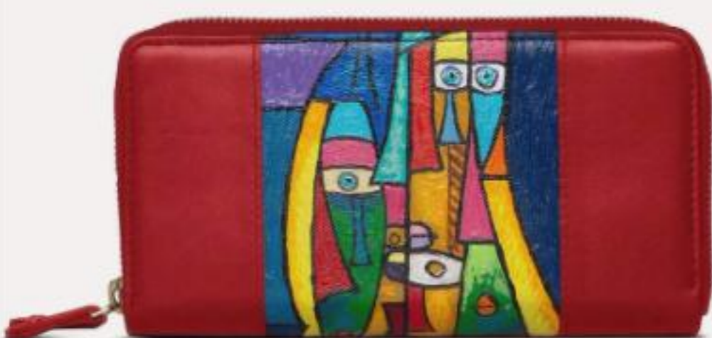
Paul Adams Kara wallet

This Christmas collection is inspired by the colour red symbolising love and happiness through this season. Expect the finest ethically sourced leather bags, that are hand-painted, turning them into bespoke pieces of beauty. All the products are UV treated and protected with the right blend of colours to add just the right hint of bling to your skater dresses or party jumpsuits.