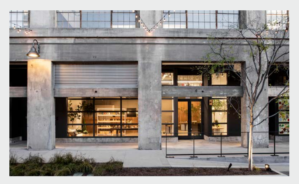
KINTO USA, Inc. KINTO STORE Los Angeles