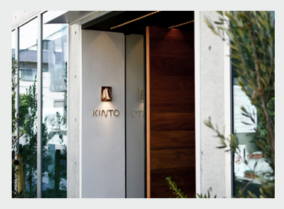
KINTO STORE Tokyo

Each KINTO location reflects the spirit of our products. There is careful thought given to the materials and subtle details for an atmosphere that is comforting and relaxing.