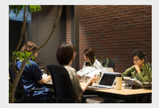
Head Office & Logistics Center Hikone, Shiga