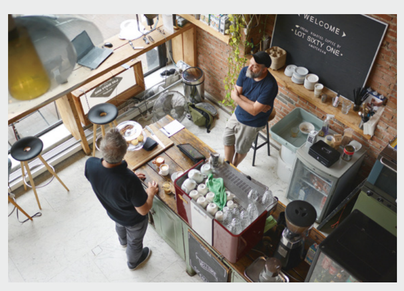
KINTO Europe members work inside a share office in Amsterdam. On the first floor is a local coffee shop LOT SIXTY ONE, a partner of KINTO and one of our favorite specialty coffee roasters.