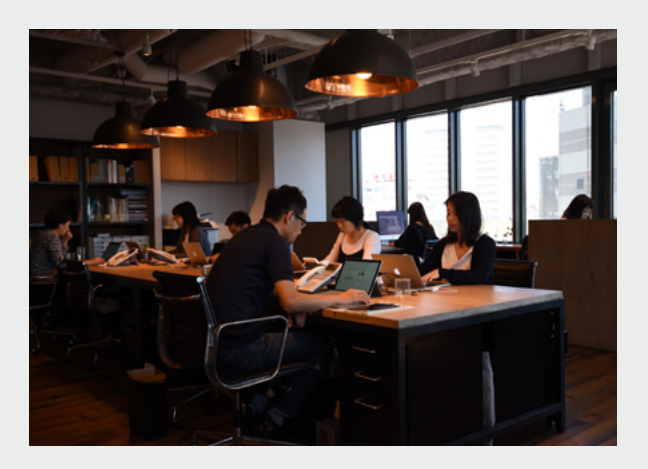
Tokyo Office & Showroom Ebisu, Tokyo

At KINTO Tokyo Office and Showroom, we welcome partners from around the world, enjoying the exchange of ideas, curiosities, and trends. While located in the vibrant city of Shibuya, it is a relaxing and close-knit space.