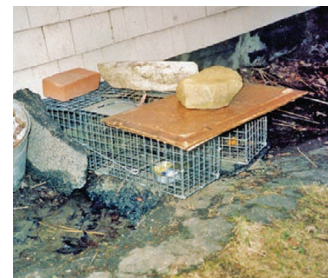
Traps set for a skunk that moved into a crawl space.

of your presence and then approach the trap slowly and quietly. Place a blanket, towel or other type of material over the trap; this and slow movements will allow you to move the trap without getting sprayed. Specialized skunk live traps that use solid-sided construction will decrease the risk of being sprayed. Before you relocate an animal, you must get permission from the property owner or manager to release it on property you neither own nor occupy.