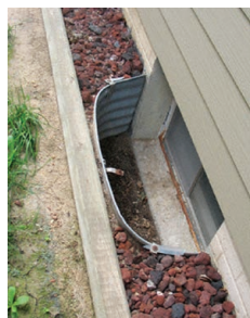
An unprotected window well.

Excluding skunks from your residence or outbuildings can effectively solve the problem with little to no contact with the animal. Seal off foundation openings with concrete, mesh or sheet metal and cover window wells. If a skunk is caught in a window well, place a ramp (for example, a piece of two-by-four lumber) in the well, to allow the animal to escape on its own.