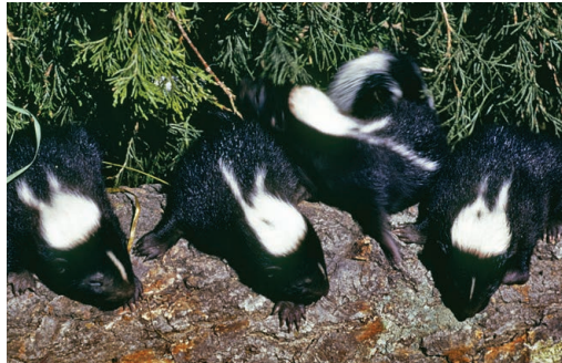
Young striped skunks.

Both striped and spotted skunks are small- to medium-sized mammals. The striped skunk averages 32 inches long (including the tail) and weighs 6-12 pounds. The spotted skunk is 16-23 inches long and weighs 1½-2 pounds. Both species are black with white markings.