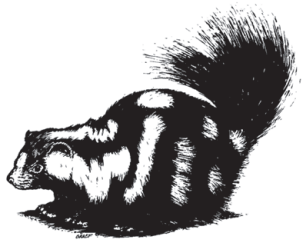
The spotted skunk is rare or extirpated in Wisconsin.

“Skunks...can be identified by their distinctive black and white coloring and the pungent odor that they sometimes leave behind.”