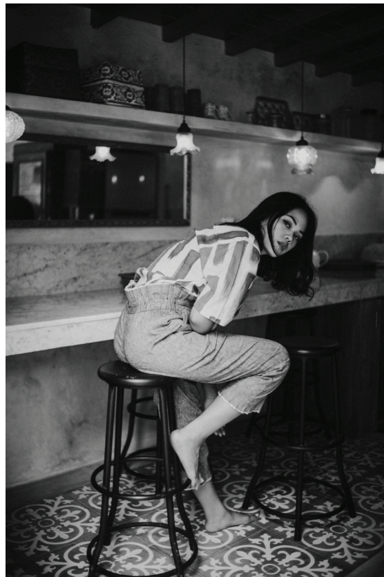
Grey Linen High-Waisted Pants / Rp 699.000 / Size : S - M / M - L