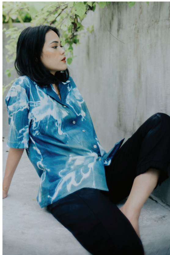
Black High-Waisted Pants / Rp 699.000 / Size : S - M / M - L