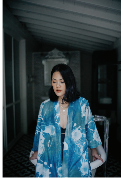
KALLULA KIMONO / Rp 1.199.000 / Size : Free Size