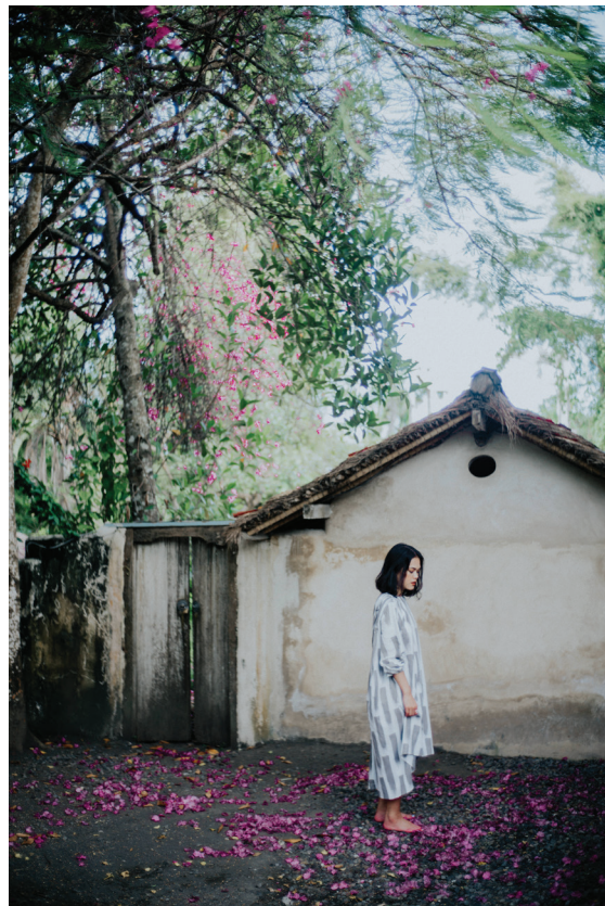
KALLULA DRESS SHIRT / Rp 1.199.000 / Size : S - M