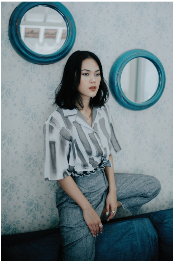
Handbrush Shirt / Rp 795.000 / Size : Free Size