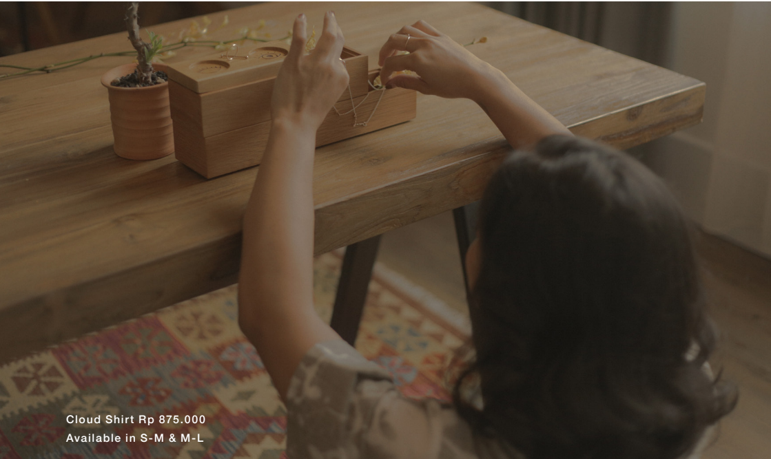
Cloud Shirt Rp 875.000 Available in S-M & M-L