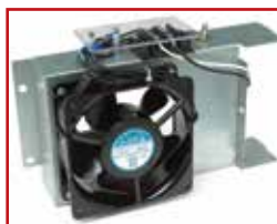
fan/heater kits options available for extreme weather