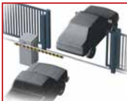
automatic p.a.m.s. sequencing with slide and swing gates