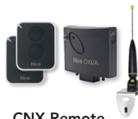
CNX Remote Control Kit