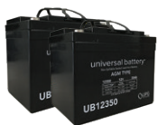
Battery Backup Kit - 35Ah