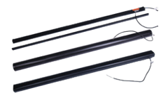
ASO Edge Sensors

SlideSmart CNX and SwingSmart CNX require professional installation