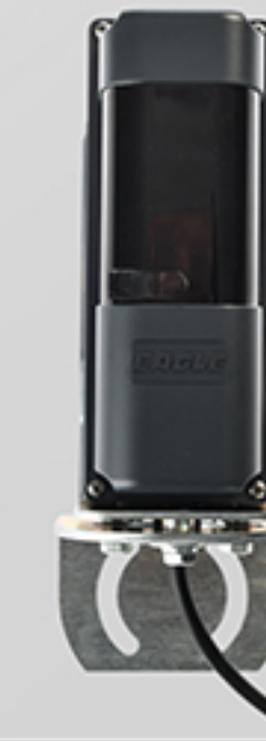
PHOTO EYE INCLUDED