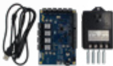
2-DOOR EXPANSION MODULES

Complete list of accessories and descriptions at: www.linear-solutions/accessories