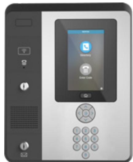
EntryPro EP-736 PN: 720-200736

Property Managers choose Linear® EntryPro for reliable value, low cost, and an embedded platform for telephone entry that offers all-weather reliability, easy management and scalability.