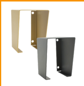
IRB-HD-SET / IRB-SH-SET