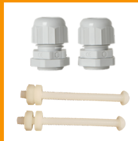
IRB-SP / IRB-S