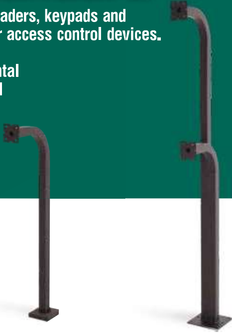
Standard Pad Mount 1200-045 In-Ground Mount 1200-046

Card readers, keypads and smaller access control devices. Square Horizontal Vertical