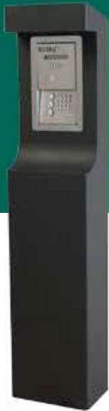
Small 1200-160 Use with 1802 and 1802-EPD flush mount systems only