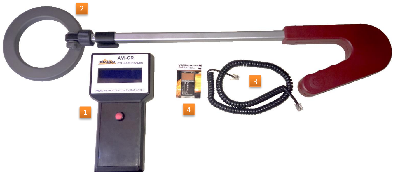
Figure 1: AVI Code Reader as supplied