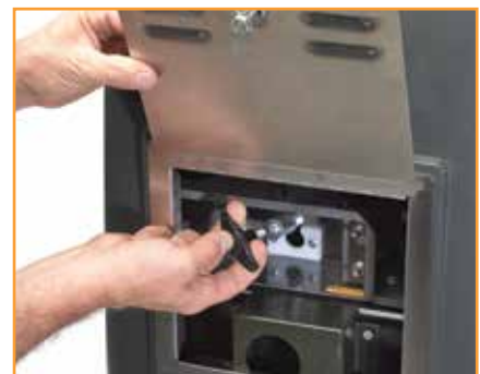
easy to use "T-Handle" release