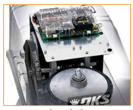
simplifies installation and provides easy access to all internal parts