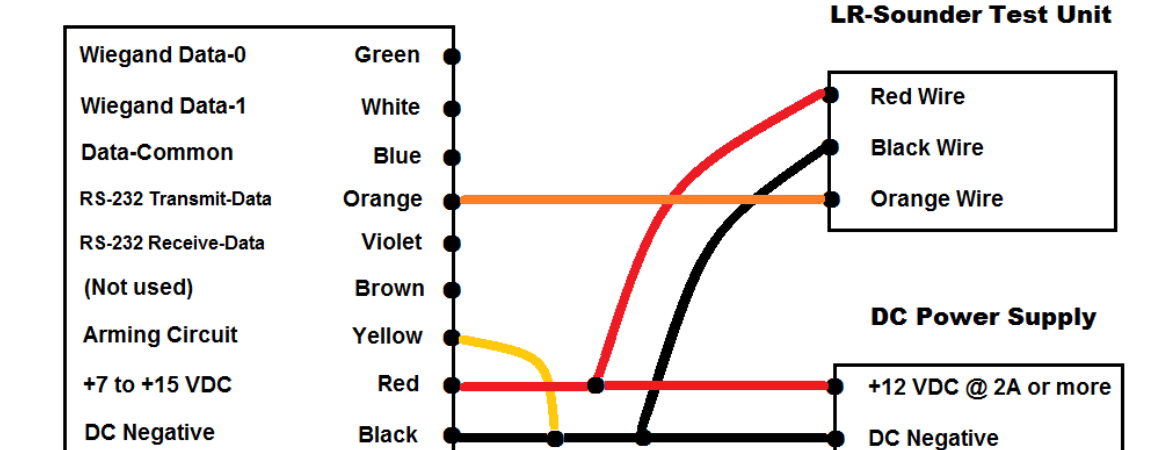
Figure 3 Wiring for quick test