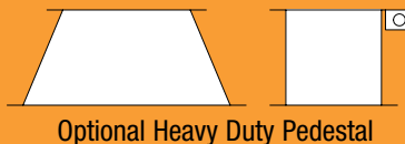
Optional Heavy Duty Pedestal

Optional Pedestal: 31.5" W x 12" H x 16.5" D (80cm W x 30.5cm H x 41.9cm D)