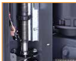
limit switches direct driven and easily adjustable