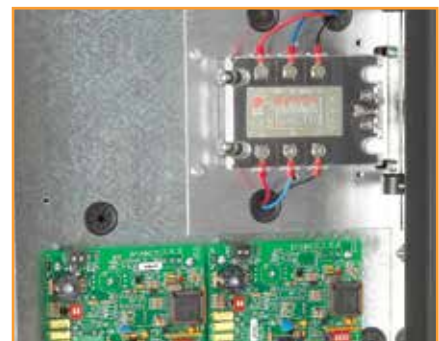
solid state motor control no relay contacts to wear out or burn