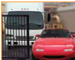
partial open open gate short distance for cars or open fully for trucks