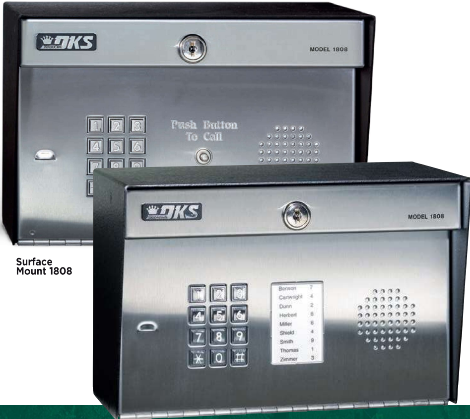
Surface Mount 1808