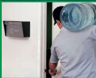
Surface Mount with built in directory/message window 1808 / 1808-AP

Flash Entry Codes allow entry on a single day only, then automatically deactivate themselves