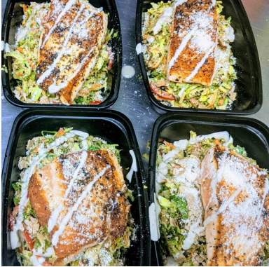
CAESAR CRUSTED SALMON