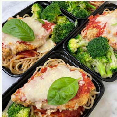
CLASSIC CHICKEN PARMESAN