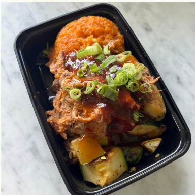
BBQ PORK SHOULDER, SWEET POTATO & MIXED VEGETABLES