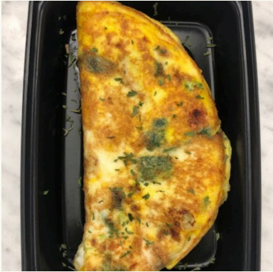
FARMERS MARKET OMELET