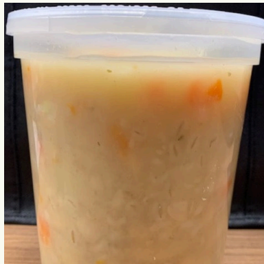
WHITE BEAN CHICKEN CHILI