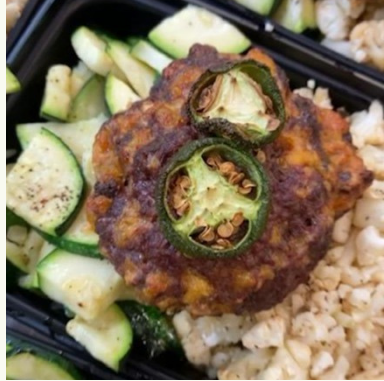
JALAPENO POPPER BURGER