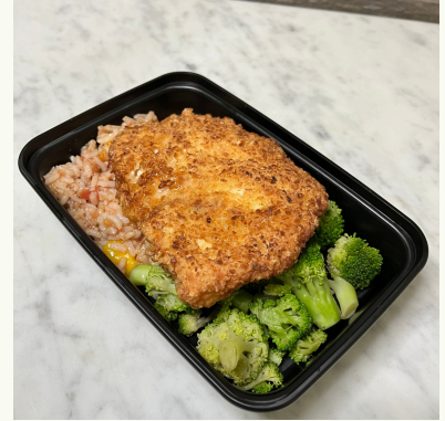
COCONUT CRUSTED CHICKEN