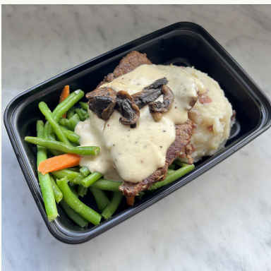
PEPPERCORN FILET STEAK