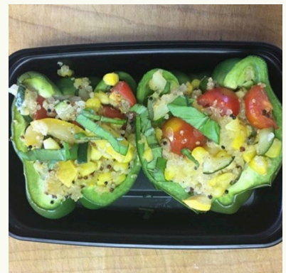
FARMERS MARKET STUFFED PEPPERS

ORDER ONLINE AT 716FRESH.COM CALL 716.662.7255