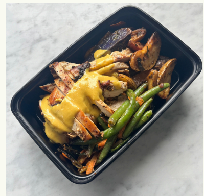
HONEY MUSTARD CHICKEN

ORDER ONLINE AT 716FRESH.COM CALL 716.662.7255