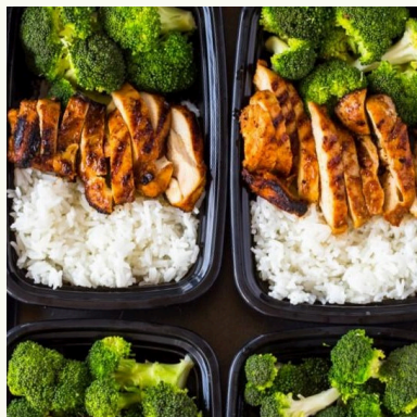
BALSAMIC CHICKEN & WILD RICE