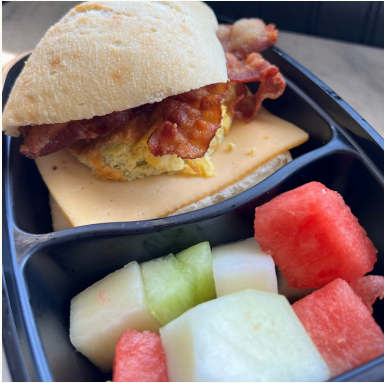
BACON, GOUDA & EGG SANDWICH