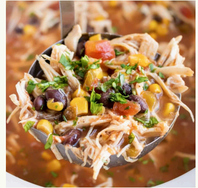
SOUTHWEST CHICKEN SOUP