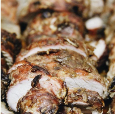
FRENCH ONION PORK TENDERLOIN