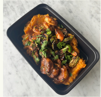
PREMIUM GARLIC CAJUN SHRIMP