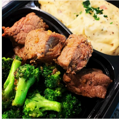
WHITE TRUFFLE TWICE BAKED POTATO & FILET