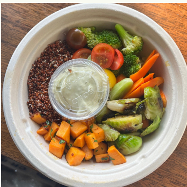
ROASTED VEGGIE GRAIN BOWL