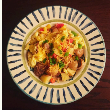
BREAKFAST TACO BOWL