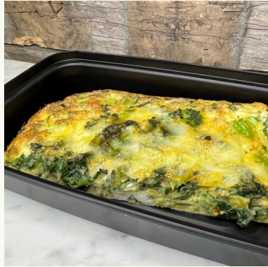
ROASTED RED PEPPER & SPINACH FRITTATA