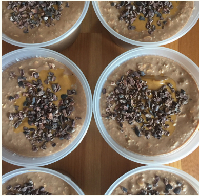
PEANUT BUTTER & CHOCOLATE OVERNIGHT OATS