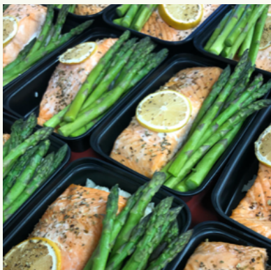
BAKED LEMON, GARLIC & HERB SALMON