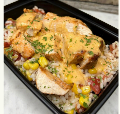
TEX-MEX CHICKEN & CHEESE SAUCE