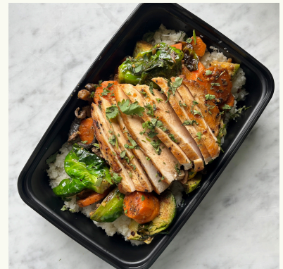
GRILLED CHICKEN & CAULIFLOWER RICE

ORDER ONLINE AT 716FRESH.COM CALL 716.662.7255