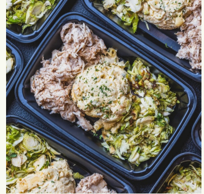
BBQ CHICKEN & MAC