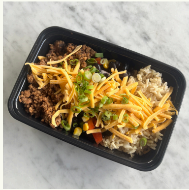
BEEF TACO BOWL