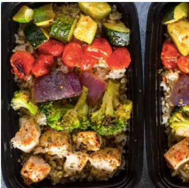
GREEK CHICKEN & ROASTED VEGETABLES