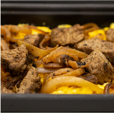
STEAK FILET & EGGS