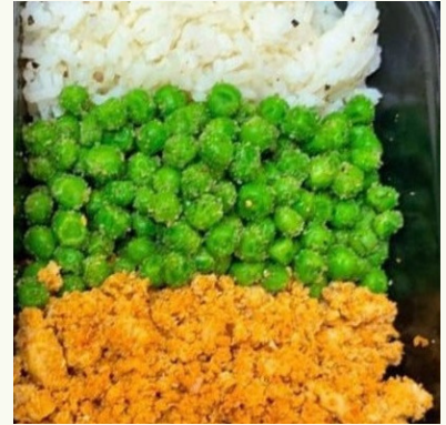
CHIPOTLE GROUND BEEF