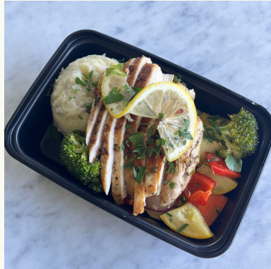
LEMON PEPPER CHICKEN, MASHED POTATOES & MIXED VEGETABLES