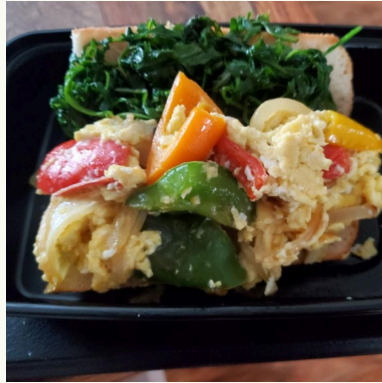
ITALIAN PEPPER & EGG PANINI