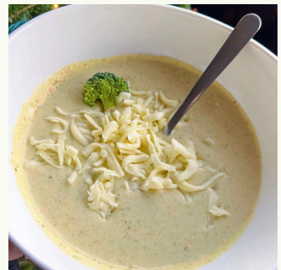
BROCCOLI CHEDDAR CHEESE SOUP

ORDER ONLINE AT 716FRESH.COM CALL 716.662.7255