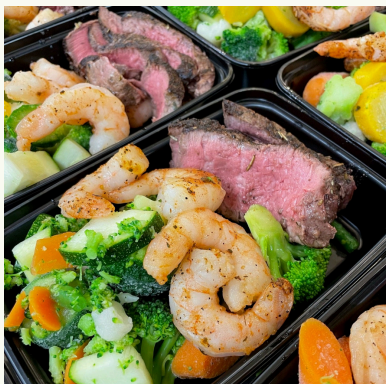
SURF & TURF