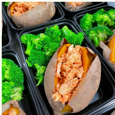
BUFFALO CHICKEN STUFFED SWEET POTATO