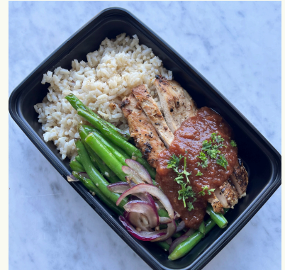
APPLE PIE BBQ CHICKEN