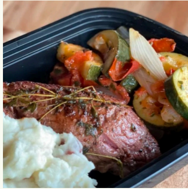
SLICED ROAST BEEF DINNER