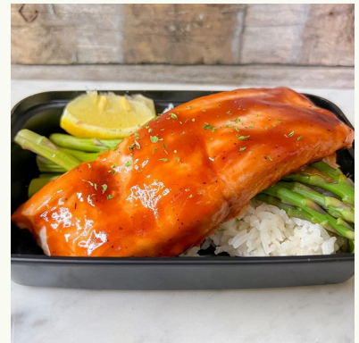
ORANGE MARMALADE SALMON

ORDER ONLINE AT 716FRESH.COM CALL 716.662.7255