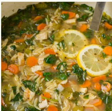
LEMON GARLIC CHICKEN AND ORZO SOUP