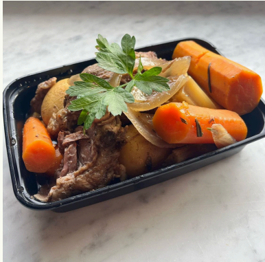
HOMESTYLE POT ROAST