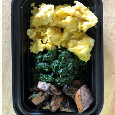
SAUTÉED SPINACH & MUSHROOMS WITH SCRAMBLED EGGS