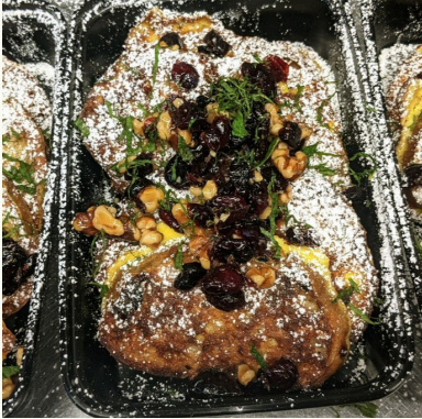
CRANBERRY WALNUT FRENCH TOAST