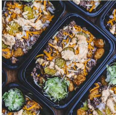
BIG MAC BOWL