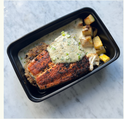
CREAMY DILL SALMON