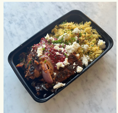
PREMIUM RASPBERRY GOAT CHEESE CHICKEN

ORDER ONLINE AT 716FRESH.COM CALL 716.662.7255