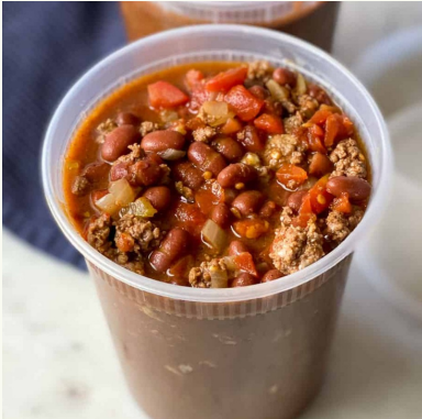
HOMEMADE BEEF CHILI