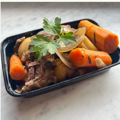
HOMESTYLE POT ROAST