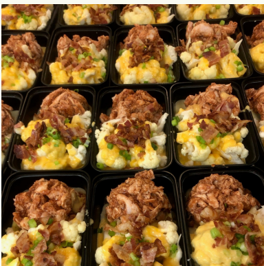
BBQ PULLED PORK