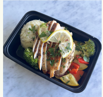
LEMON PEPPER CHICKEN, MASHED POTATOES & MIXED VEGETABLES