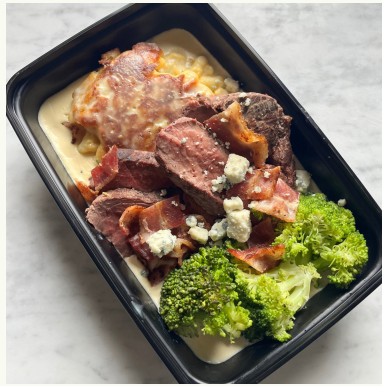
STEAK BACON & BLUE