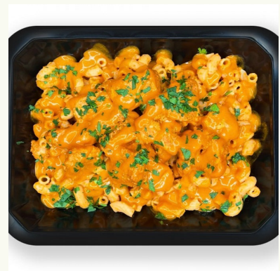
BUFFALO CHICKEN MAC & CHEESE

ORDER ONLINE AT 716FRESH.COM CALL 716.662.7255