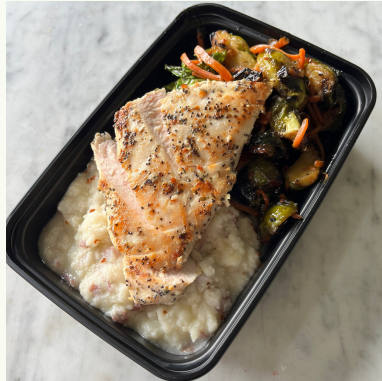
ROASTED CHICKEN WITH MAPLE BRUSSELS