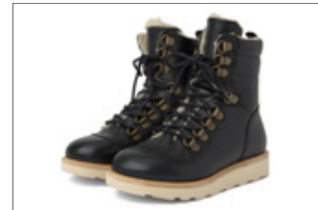
SMITHY Fur-lined hiking boots Available in sizes 24-35 Upper Material: Leather Lining: Leather Outsole: EVA/Leather Colours: Black and chestnut brown