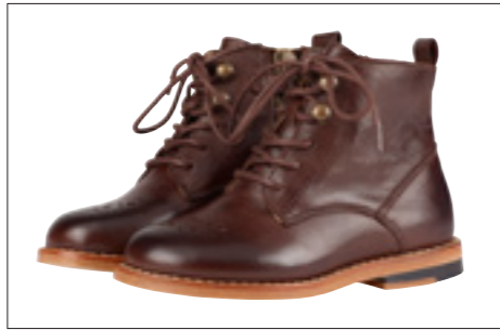
BUSTER Brogue boots Available in sizes 22-35 Upper Material: Leather Lining: Leather Outsole: Leather/Leather Colours: Black, dark brown and tan burnished

Blending retro-cool with classic British heritage styles, our shoes are designed in East London and made in Europe using the highest quality materials. Acknowledging trends, we give them our own Young Soles twist and whether it's borrowing from childhood memories, music or a style movement, there is always inspiration to be found amongst urban British culture.