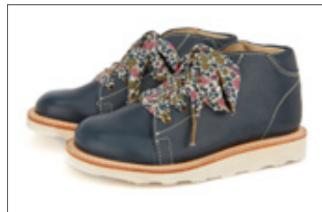
HATTIE Monkey boots Available in sizes 20-35 Upper Material: Leather Lining: Leather Outsole: EVA/Leather Colours: Chestnut brown and navy