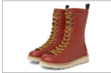
COOPER Tall monkey boots Available in sizes 26-35 Upper Material: Leather Lining: Leather Outsole: EVA/Leather Colours: Black and brick