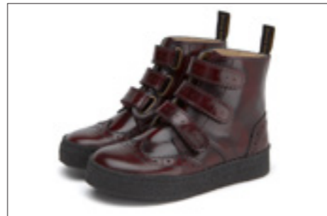
FREDDIE Brogue boots Available in sizes 24-40 Upper Material: Leather Lining: Leather Outsole: Crepe Colours: Black, damson and oxblood high shine