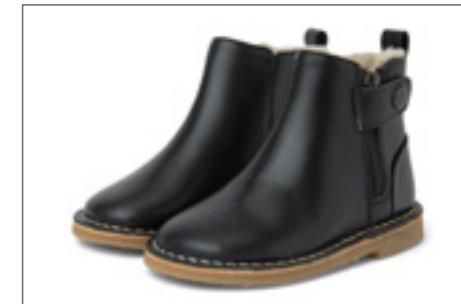
WINSTON Brogue boots Available in sizes 24-35 Upper Material: Leather Lining: Leather Outsole: EVA/Leather Colours: Black and tan burnished