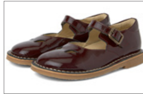
MABEL Mary Jane shoes Available in sizes 20-35 Upper Material: Leather Lining: Leather Outsole: Rubber Colours: Black patent, cherry patent, grey burnished and tan burnished