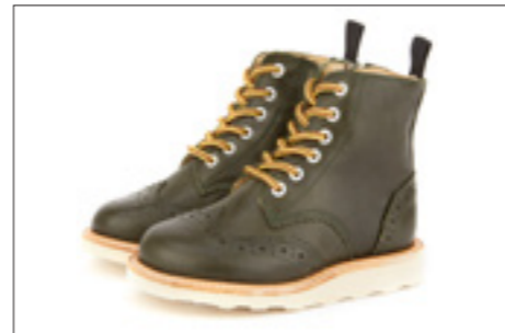
SIDNEY Brogue boots Available in sizes 24-35 Upper Material: Leather Lining: Leather Outsole: EVA/Leather Colours: Black, cherry, hunter green, silver and tan burnished