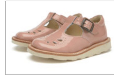
ROSIE T-bar shoes Available in sizes 20-40 Upper Material: Leather Lining: Leather Outsole: EVA/Leather Colours: Black, black patent, blush pink patent, cherry patent, chestnut brown, damson, London red patent, mustard, navy, rose gold and silver