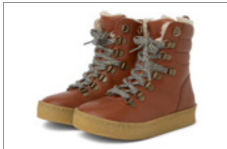
ERNEST Fur-lined hiking boots Available in sizes 24-35 Upper Material: Leather Lining: Leather Outsole: Crepe Colours: Black, brick and chestnut brown