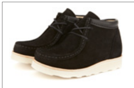
JOEY Fur Wallabee boots Available in sizes 20-40 Upper Material: Fur/suede Lining: Leather Outsole: EVA/Leather Colours: Black and stone