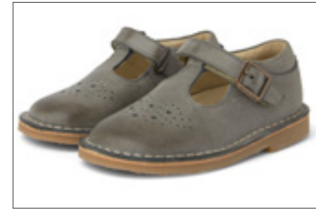
PENNY T-bar shoes Available in sizes 20-35 Upper Material: Leather Lining: Leather Outsole: Rubber Colours: Black, cherry patent, grey burnished and tan burnished