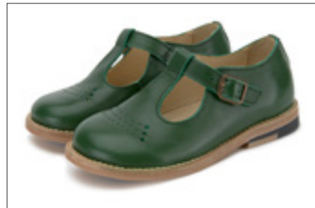
DOTTIE T-bar shoes Available in sizes 22-35 Upper Material: Leather Lining: Leather Outsole: Leather/Leather Colours: Navy patent, pea green, London red patent and tan burnished