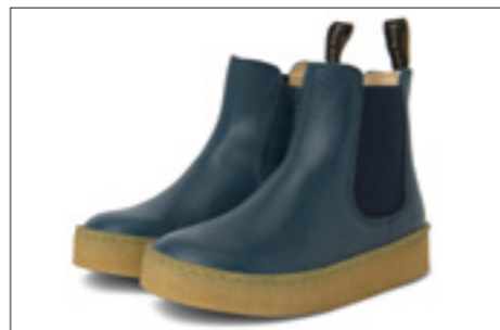
LENNON Chelsea boots Available in sizes 20-35 Upper Material: Leather Lining: Leather Outsole: Crepe Colours: Black, navy and tan burnished

With all the features parents should expect from a child's shoe, our lasts follow the shape of the foot with a wide toe and narrow heel. Our lightweight and flexible shoes mix traditional detailing with contemporary materials, chosen for growing feet and first steps.