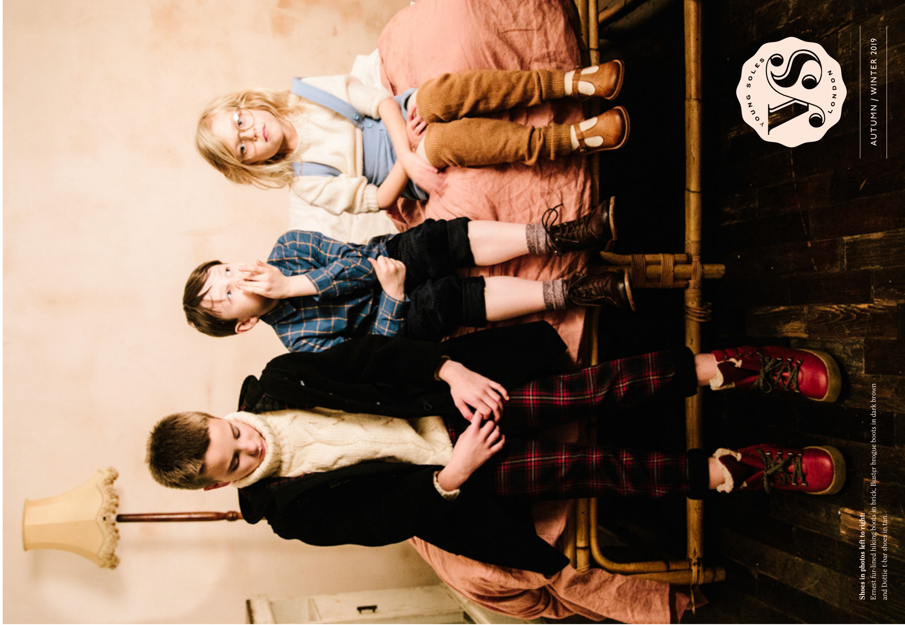
Shoes in photos left to right: Ernest fur-lined hiking boots in brick, Buster brogue boots in dark brown and Dottie t-bar shoes in tan.