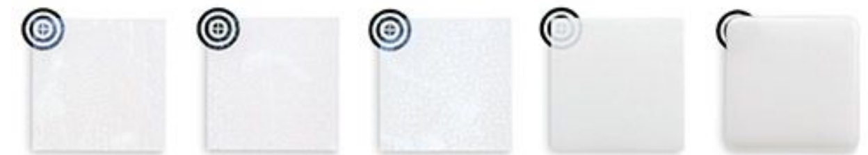
Translucent White Opalescent (000243-0030-F)