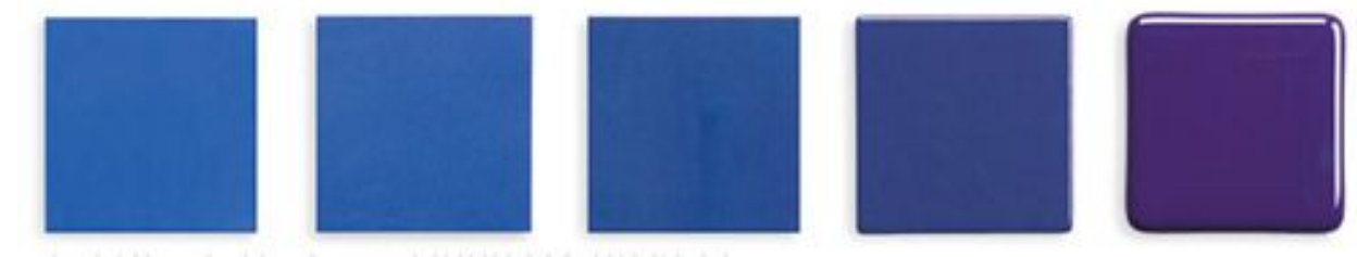
Gold Purple Opalescent (000334-0030-F)