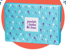
Bake Box 1 Year Subscription