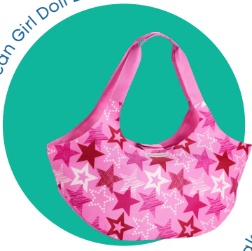
American Girl Doll Bag