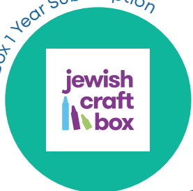
Craft Box 1 Year subscription