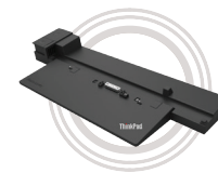
ThinkPad® Performance Dock