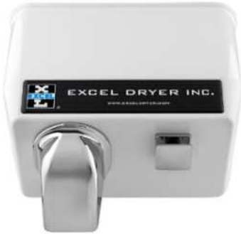
PART # 76-W