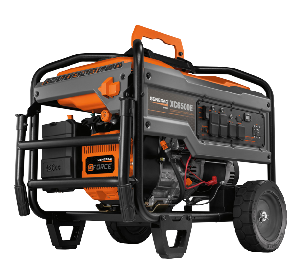
Photograph may not represent actual content.

AC Rated Output Running Watts 6500 AC Maximum Output Starting Watts 8125